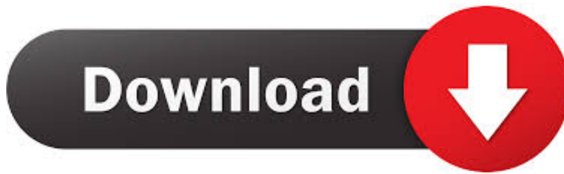
Tableau Desktop 2019.4.3 Crack Product Key Free Download